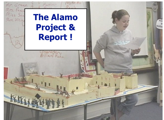
The Alamo Project & Report !